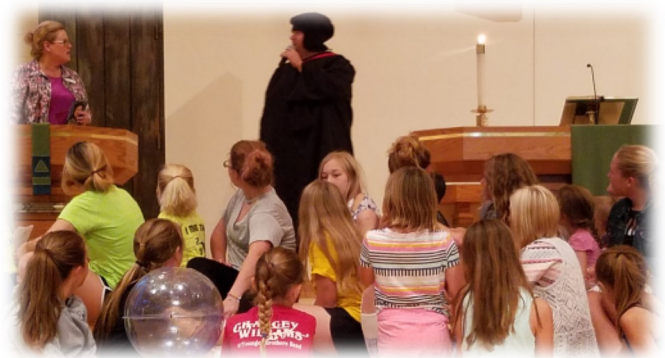
Martin Luther stopped by Good News Time to share a little of his story.

Do you ever wonder why we have so many Christian denominations, and if there is really much difference between them? The answers to these questions lie in the dramatic and turbulent times of the Reformation. Join Adult Sunday and Wednesday School for a study series called Reformation Roots that brings to life the stories and struggles that still impact us today. Sundays at 9:40 a.m. East Fellowship Hall and Wednesdays at 7:10 p.m. in Conference Room 1. No sign up necessary.